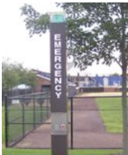
One of the many Blue Emergency Light Telephones on campus.

Victims interested in pursuing campus disciplinary action should contact the Office of the Vice President for Student Affairs. Detailed information on the sexual offense code of conduct violations and disciplinary procedures can be found at www.tcnj.edu/~sa/handbook/judstructure . Consistent with the state's Campus Sexual Assault Victim's Bill of Rights, the campus conduct system affords the victim and alleged violator access to legal assistance, to have an advisor present, to be afforded accommodations to ensure safety during the hearing, and to be informed of the outcome of any disciplinary proceeding. This document can be found at www.tcnj.edu/~tcnjpd .