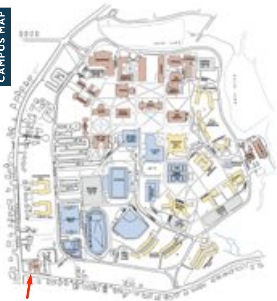
The Office of Campus Police Services is located in the Administrative Services Building (ASB).