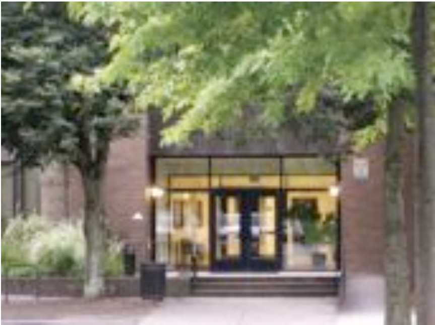
Office of Campus Police Services located in the Administration Services Building.