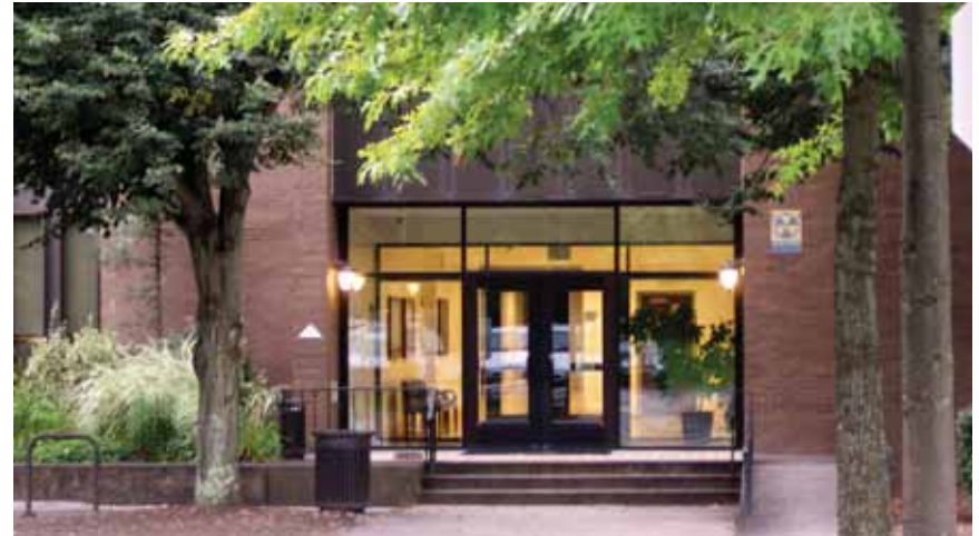
Office of Campus Police Services located in the Administrative Services Building.