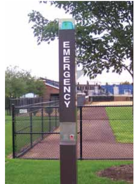
One of the many Blue Emergency Light Telephones on campus.

Crime prevention materials and reporting procedures are included in the faculty handbook and the student handbook. Human Resources provides