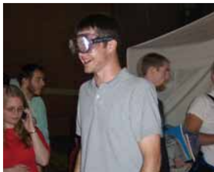
A student walks the line while wearing Fatal Vision Goggles which simulate impaired vision.

The College of New Jersey is an educational institution committed to maintaining an environment that enables community members to enjoy the benefits of an optimal