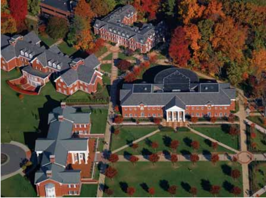
Aerial view of campus.